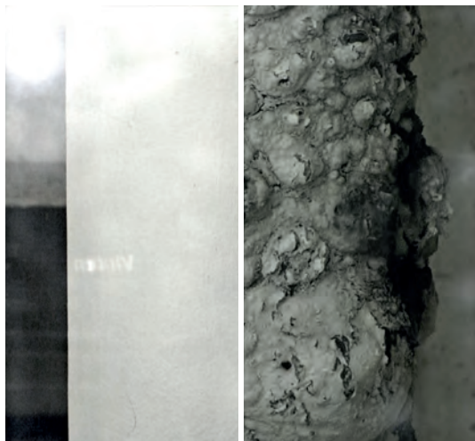
The SteelMaster range of intumescent coatings has been extensively and independently tested.

With steelwork being brought to life as a feature of the building, SteelMaster intumescent paint can be applied to offer excellent levels of fire protection without the need for boxing in or using less aesthetically pleasing cementitious coverings.